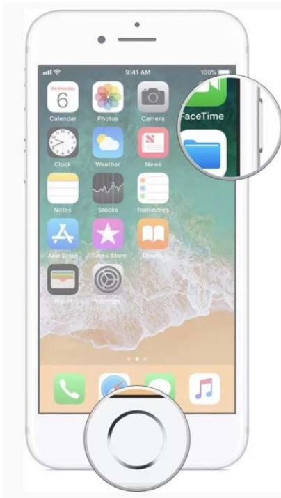
Figure 1: iPhone 8 and earlier