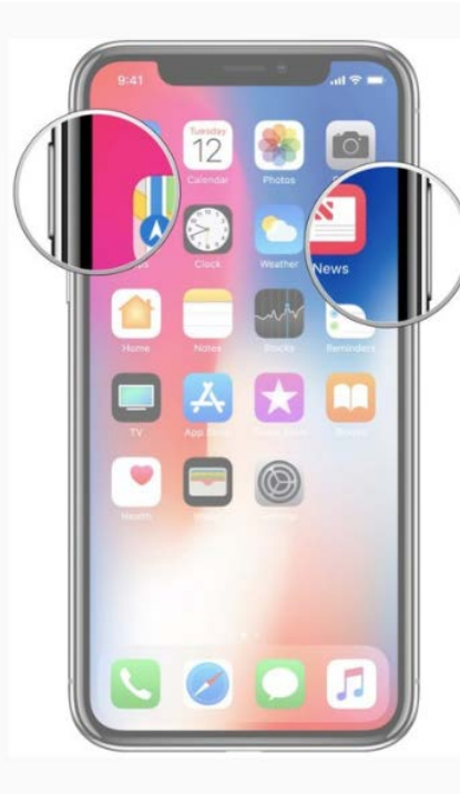
Figure 2: iPhone X and later